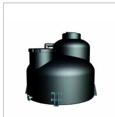
Standard Vertical Bunded 1500 Lt - 50,000 Lt