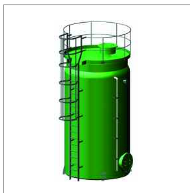
Standard Vertical 1000 Lt - 150,000 Lt