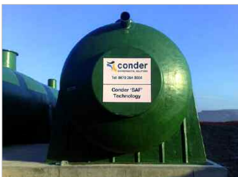
Above Ground Horizontal