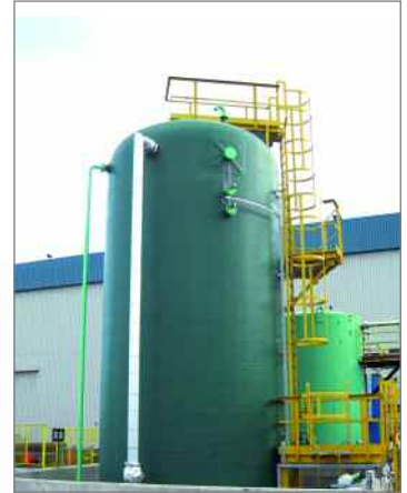
Corus Steel Installation Hartlepool